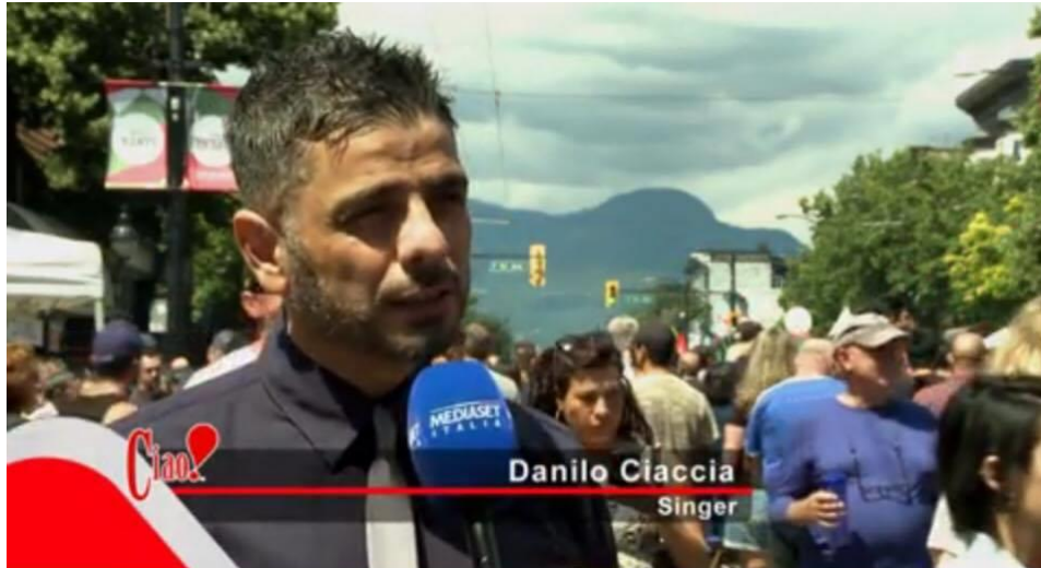
A remake of an Old Italian serenade which tells of a Love Story set in Italy during the Italian immigrations after World War II and in current modern times in North America